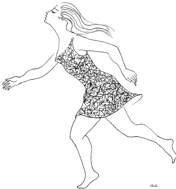
Fig. 1. The snapshot hypothesis proposes that the conscious perception of motion is not represented by the change of firing rate of the relevant neurons, but by the (near) constant firing of certain neurons that represent the motion. The figure is an analogy. It shows how a static picture can suggest motion.

broad classes: driving and modulating inputs 13 . For cortical pyramidal cells, driving inputs may largely contact the basal dendrites, whereas modulatory inputs include back-projections (largely to the apical dendrites) or diffuse projections, especially those from the intralaminar nuclei of the thalamus.